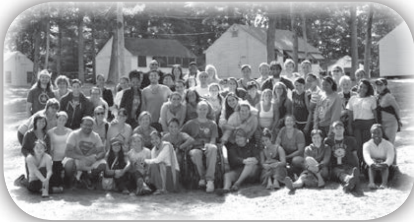
Draftfcb counselors at Birch Family Camp get more than they give.

I've always believed that do-gooders do better, personally and professionally. With that mindset, I was deeply affected by a 60 Minutes report in 1995 about Birch Family Camp (now part of One Heartland http://oneheartland.org/camps-and-programs/birch-family-camp ). It does so much to help kids and their families dealing with HIV/AIDS. The organization was struggling. It needed help. That's why I picked up the phone the next day and called the organization directly to offer our agency's support.