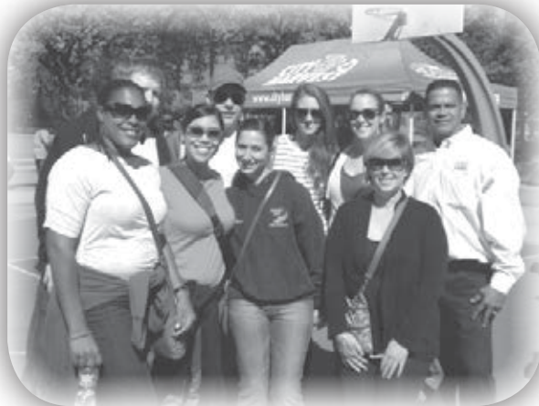
The CDM team doing GOODWorks at City Harvest in Queens.