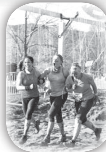
Running through "ElectroShock Therapy" to the finish line.

Note to future Mudders: I would not recommend linking arms. Although it's a nice photo op, electric current does travel