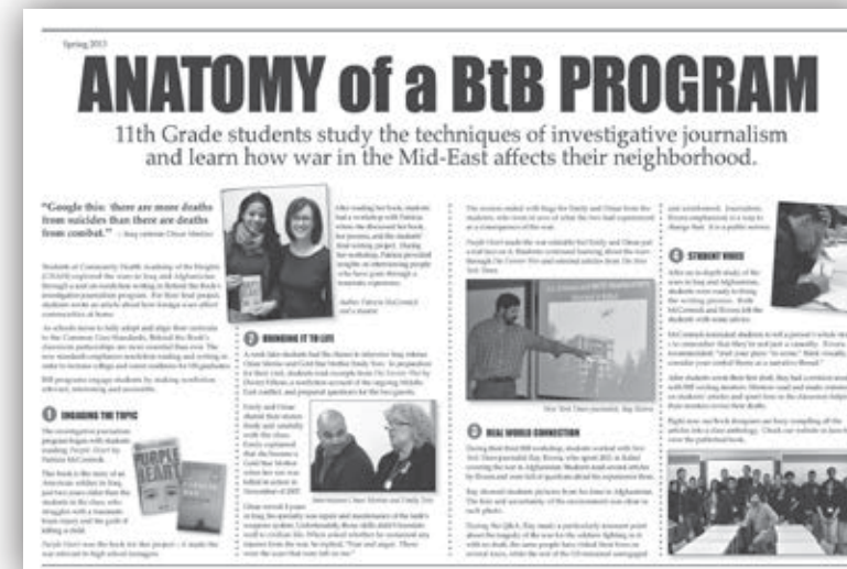
Behind the Book's Spring 2013 Newsletter, with printing donated by Harrison and Star.