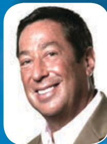
Howard Draft DRAFTFCB Summers To Remember PAGE 10