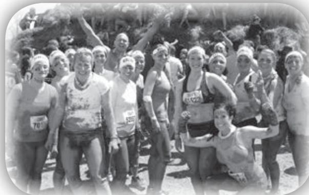
Group shot before climbing "Bale Bonds."

We reach "Everest," a quarter-pipe covered in mud and grease. The challenge here is to sprint up the pipe and hope someone at the top catches you. Several of my teammates, with the help of other fellow Mudders, get pulled to the top. I try over and over, but each time I just slam