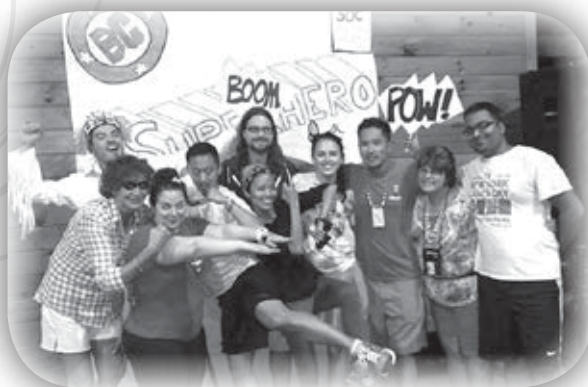
Fun and love abound at camp.

The tradition began in 1997 with 10 volunteers from our New York office and expanded in 1998 to include Chicago volunteers. Sixteen years later, 38 staffers from both cities went to Camp Laurelwood in Connecticut for one of two weeks to teach, play with, and mentor 200 kids and 100 adults. Our agency gladly covers all their travel expenses, recognizing that our people get as much if not more out of the experience as the kids.